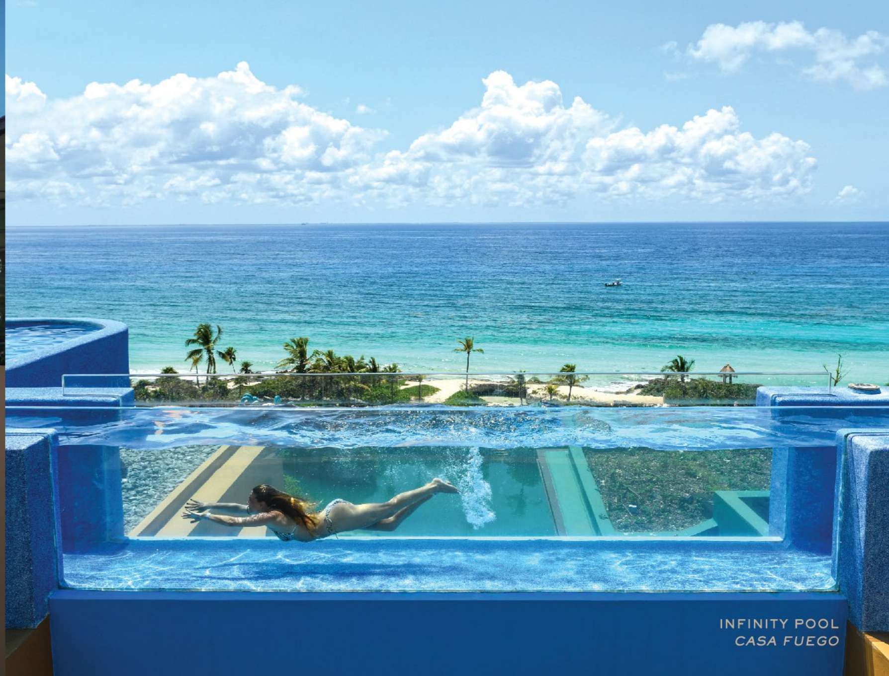
INFINITY POOL CASA FUEGO