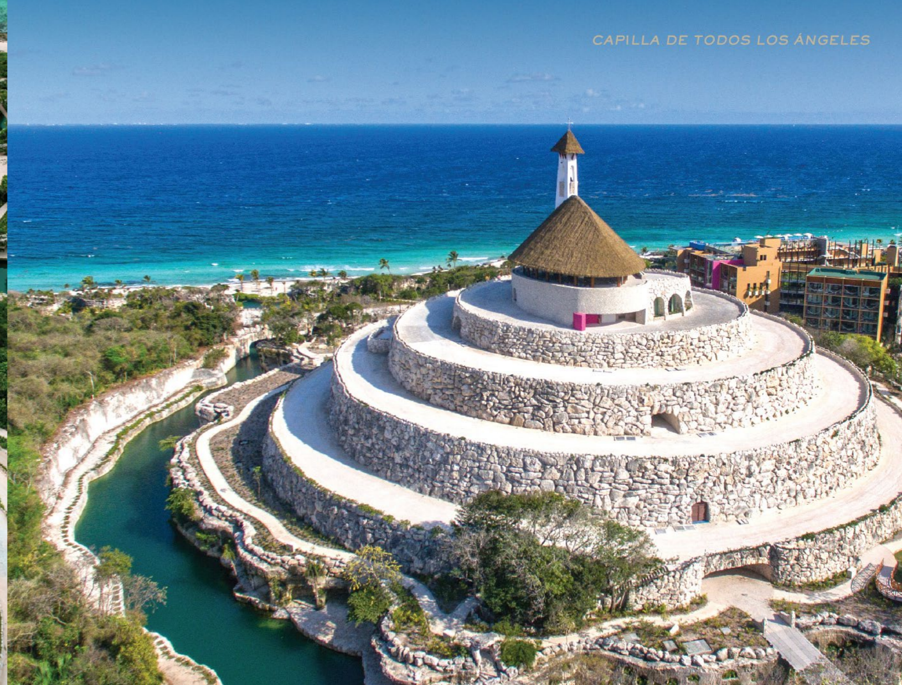
CAPILLA DE TODOS LOS ÁNGELES